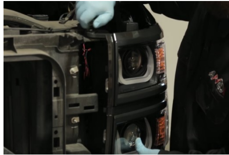
Reinstall the new headlights in reverse order.