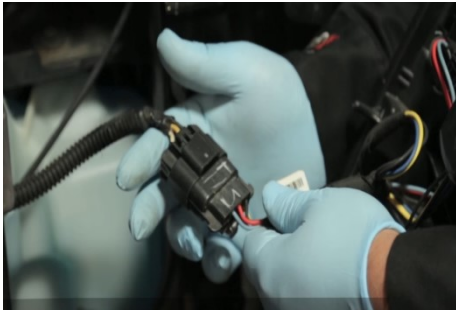
Disconnect the headlight wiring harness.