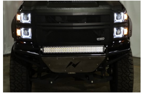
Test all functions before driving.