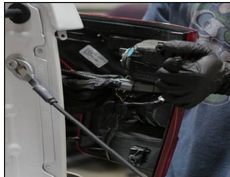
Disconnect main connector harness from factory tail light.