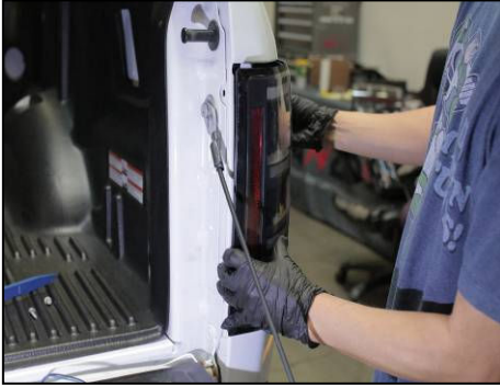
After tail light has proper fitment install two 8mm bolts.