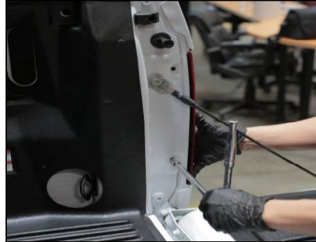
Lower tail gate and remove two 8mm bolts.