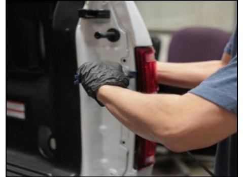
When removing tail light a panel popper might be needed to help release tail light.