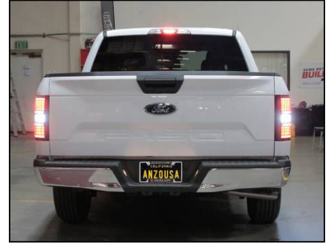
Test all functions of tail lights before operating vehicle.