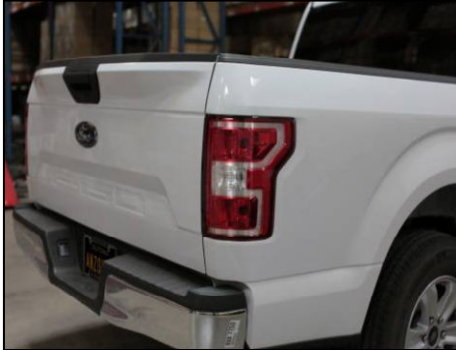
Factory 2018 F-150 tail light