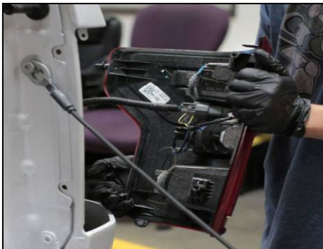
Pull tail light backwards from fender well to remove.