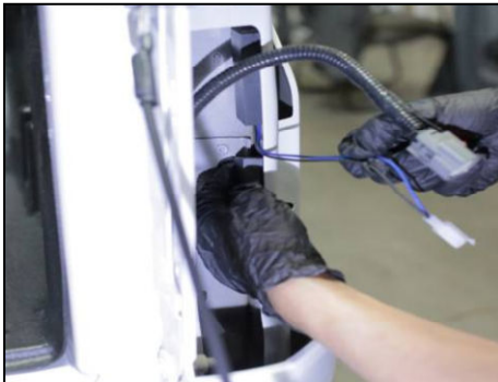
Remove 3m backing tape from resistors and press into fender well securely.