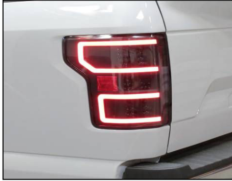
Repeat steps 2-10 on opposite side to finish installation.