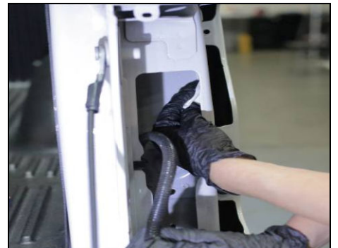
Clean surface area inside fender well with mild soap or rubbing alcohol to remove any dirt or grime.