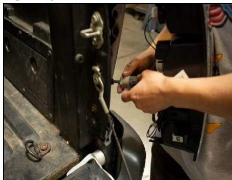
Disconnect main tail light harness connector.