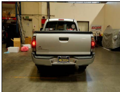
Repeat steps 3-7 for other tail light. Check all functions of light before driving.