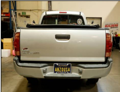
Stock Toyota Tacoma Tail lights