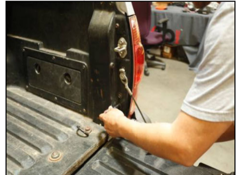
Remove two 10mm bolts