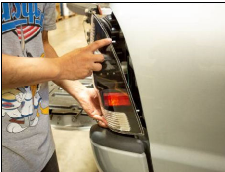
Slide Anzo USA tail light into fender while guiding tail light locating pins into opening.